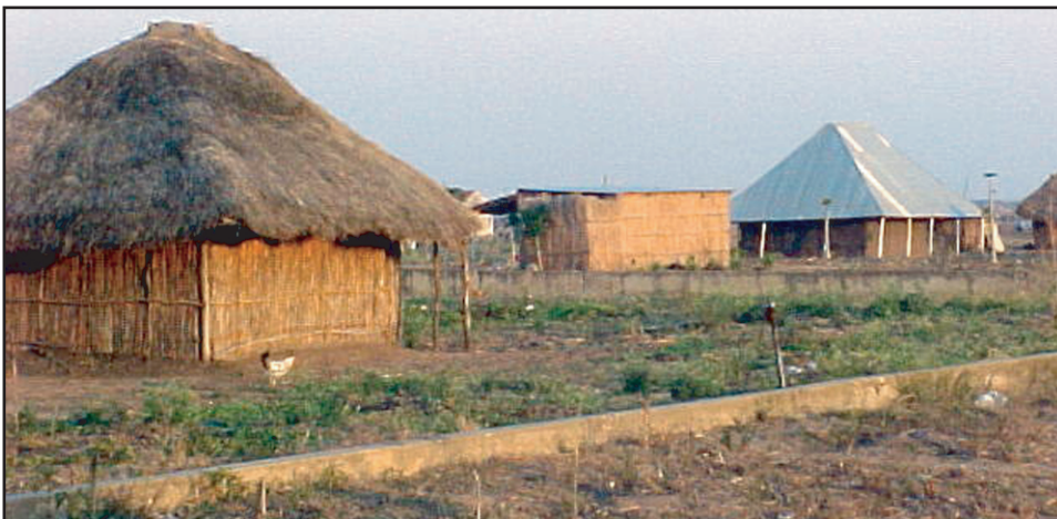
Chókwè District, Mozambique