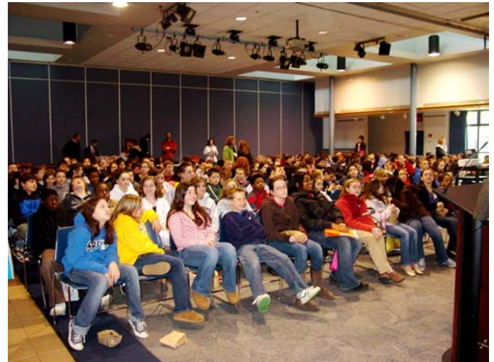
250 Future Geographers. Middle schoolers from Scotch Plains-Fanwood visited on April 3, 2008. Geography faculty & grad students presented on topics like NJ geography, cartography, climate change, immigration, visual geography, water resources, hazards and other topics. The outreach program was also assisted by the Ofc of Instructional & Research Technologies, the Livingston Deans Ofc & the RU Football Program!