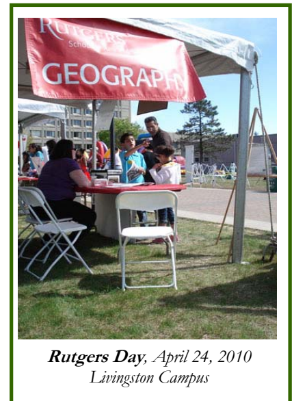
Rutgers Day, April 24, 2010 Livingston Campus